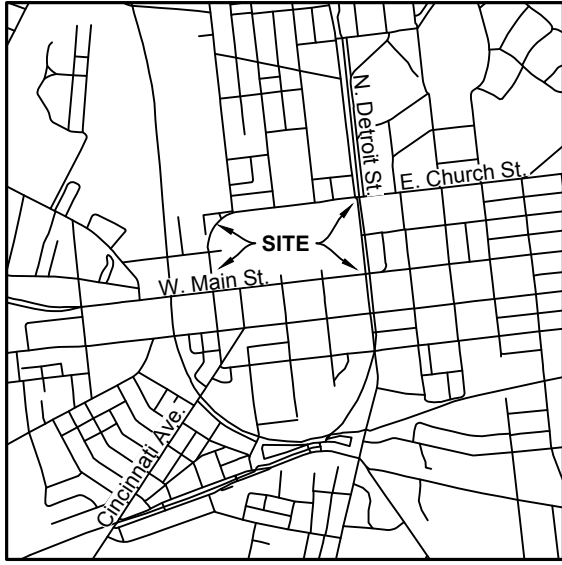
VICINITY MAP NO SCALE